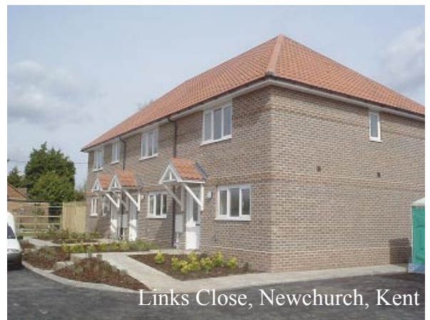
Links Close, Newchurch, Kent