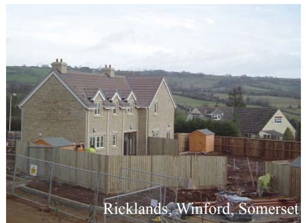
Ricklands, Winford, Somerset