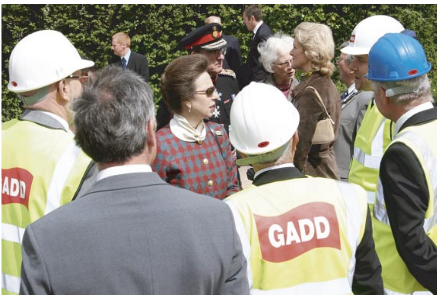
Above: HRH The Princess Royal, president of the Rural Housing Trust, talks to builders at Beer, Devon.