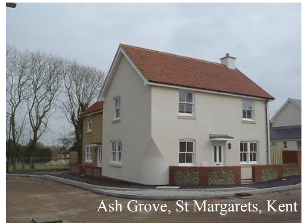
Ash Grove, St Margarets, Kent