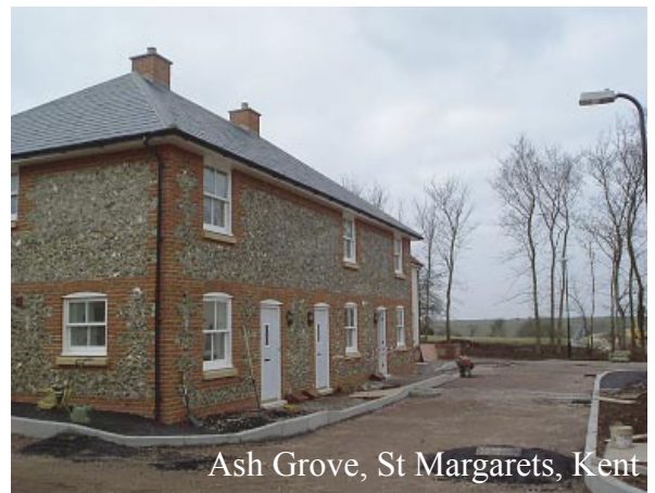
Ash Grove, St Margarets, Kent